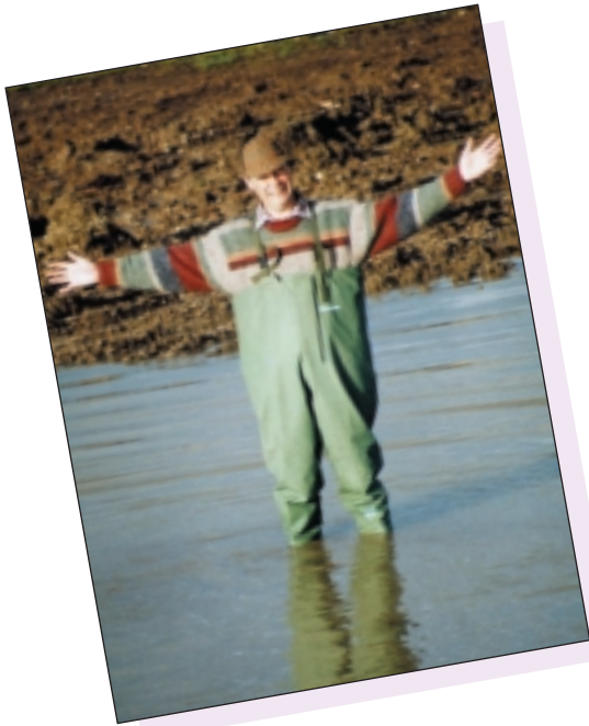
Pictured here is UKIP Action Man Nigel Farage posing for the TV cameras in the middle of a very large, but newly formed lake in Dartford, Kent. The land, on which the local Labour Borough Council proposes to build houses, is on the flood plain of the river Darent.. But then John Prescott is keen to build hundreds of thousands of new houses all over Southern England, so this site must be perfectly OK!